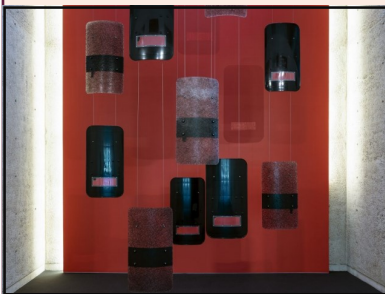
OCCURRENT AFFAIR Ngununggula Regional Gallery

OCCURRENT AFFAIR Addresses current socio-political, economic & environmental issues, while celebrating the strength, resilience & continuity of Aboriginal culture. The exhibition reflects on the ongoing state of affairs affecting 1st Nations communities.—issues that are relevant to all Australians.